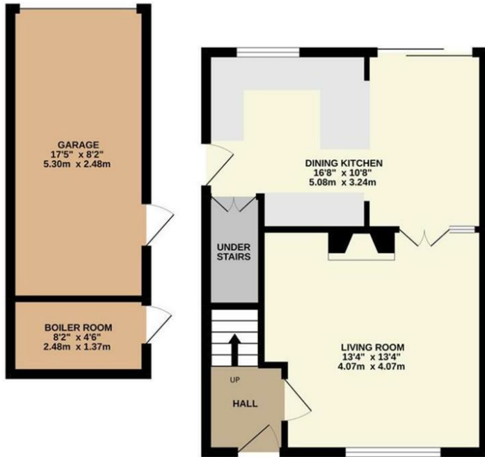
GROUND FLOOR 571 sq.ft. (53.0 sq.m.) approx.