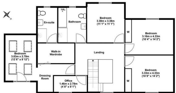
First Floor Approx 99.00 Sq meters (1066.00 Sq feet).