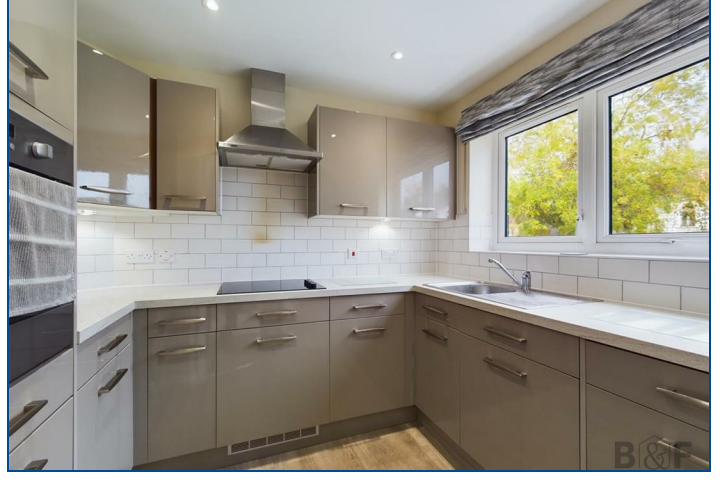
New Pooles Lodge, Fishponds, BS16 4FB £200,000