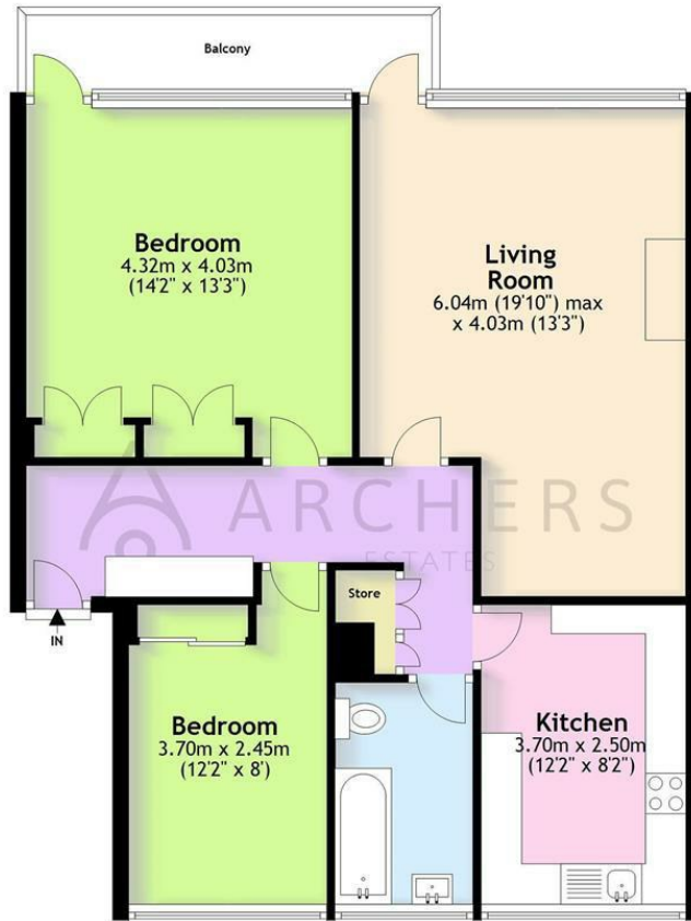
Total area: approx. 75.3 sq. metres (810.6 sq. feet)

Whilst every attempt has been made to ensure the accuracy of the floor plan contained here, measurements of doors, windows, rooms and any other items are approximate and no responsibility is taken for any error, omission, or mis-statement. This plan is for illustrative purposes only and should be used as such by any prospective purchaser. The services, systems and appliances shown have not been tested and no guarantee as to their operability or efficiency can be given. Plan produced using PlanUp.