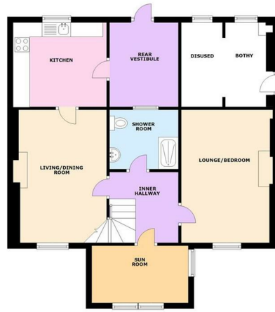
GROUND FLOOR APPROX. 77.0 SQ. METRES (829.3 SQ. FEET)