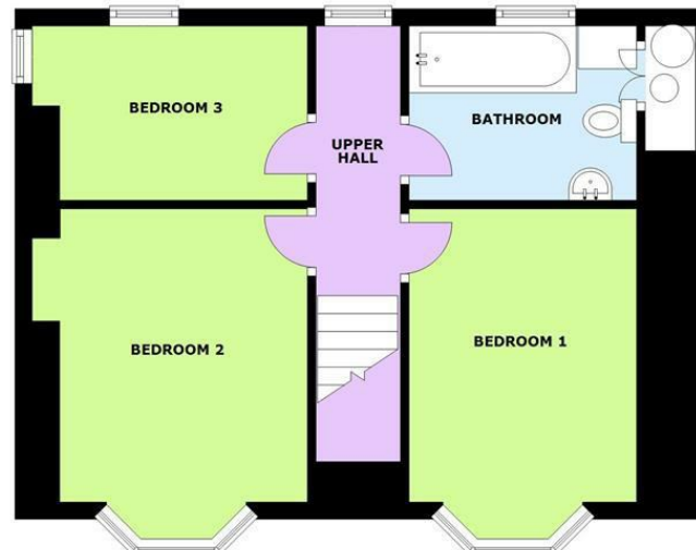
UPPER FLOOR APPROX. 40.7 SQ. METRES (438.2 SQ. FEET)

TOTAL AREA: APPROX. 76.5 SQ. METRES (823.9 SQ. FEET)