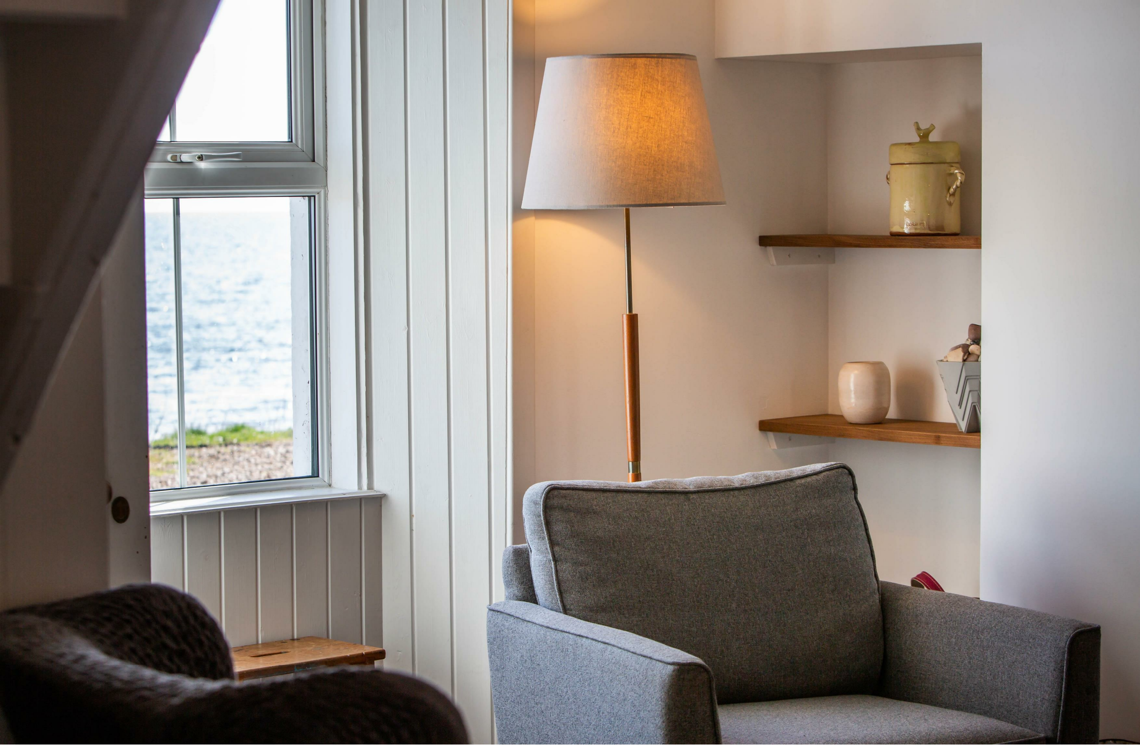
Eldon Cottage Corrie, Isle of Arran, KA27 8JP