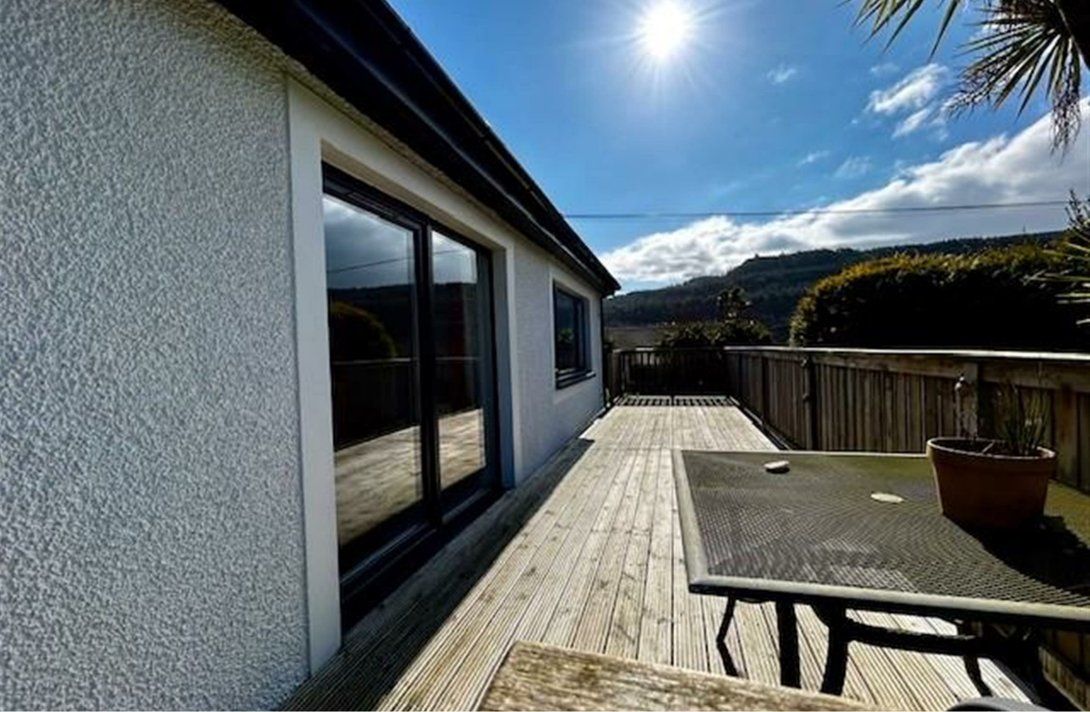
Falls View, Bellfield Road, Whiting Bay, Isle Of Arran, KA27 8QS