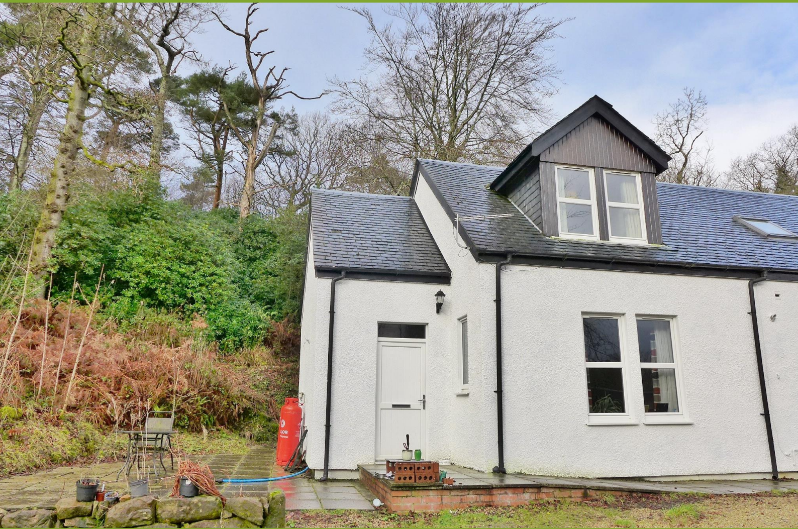
Chestnut Cottage, Glencloy, Brodick, KA27 8DA