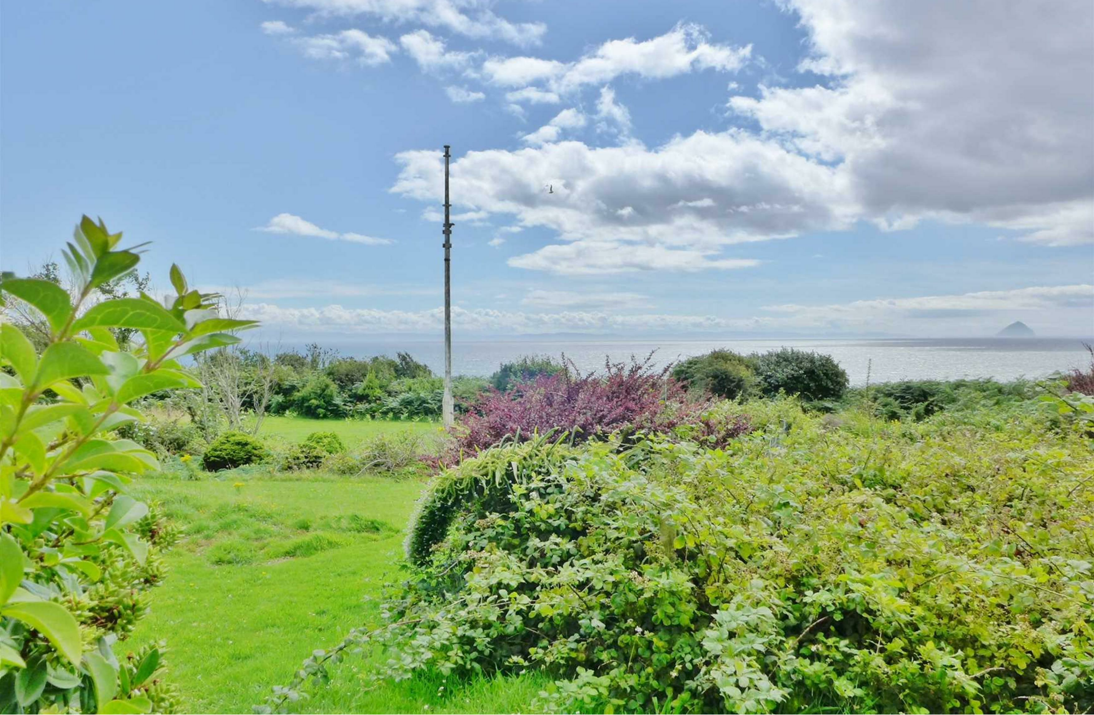
Plot 2 Old Coast Guard House, Kildonan, Isle of Arran, KA27 8SD