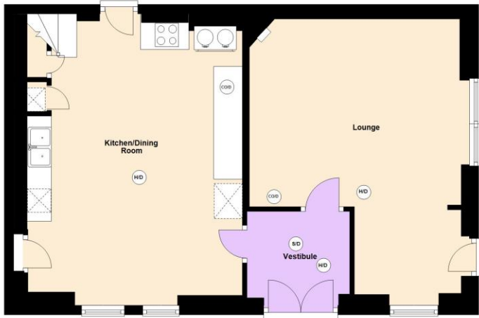
Westfield Ground Floor Approx. 57.4 sq. metres (617.3 sq. feet)