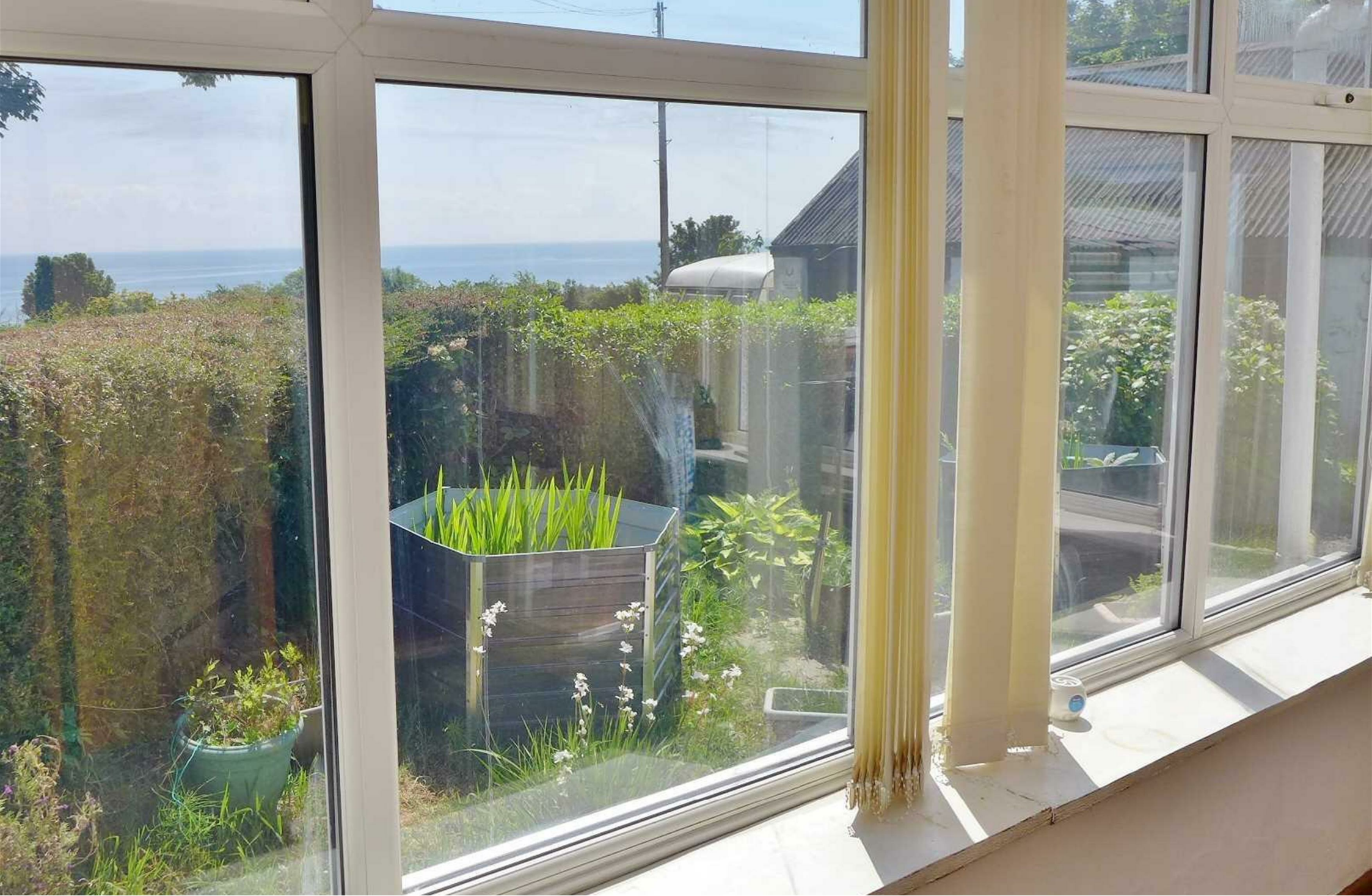
Kings Cross, Whiting Bay, KA27 8RG