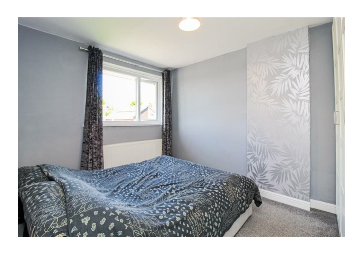
BEDROOM TWO 8'11" x 9'6" (2.72m x 2.91m)

UPVC double glazed window to the front and radiator.