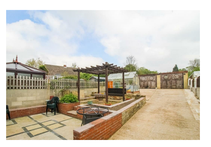
DOUBLE GARAGE 23'5" x 23'1" [7.16m x 7.04m]

To the front is a low maintenance garden with plants and shrubs bordering and gated access to garage. To the rear is a low maintenance garden incorporating patio with pergola and