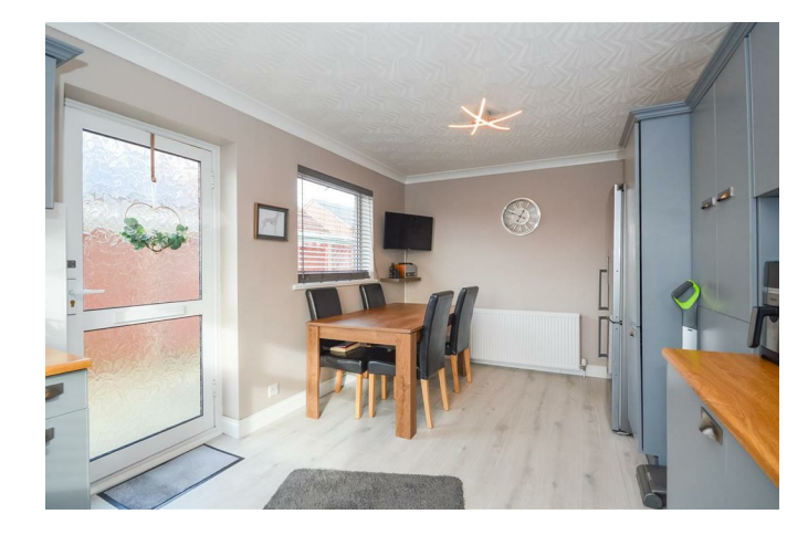
LIVING ROOM 17'8" x 11'9" (5.4m x 3.6m) Windows to the front and side, two central heating radiators and

A well proportioned dining kitchen with windows to both the front and side, external door to the side and fitted with a good range of contemporary grey fronted wall and base units with contrasting wood effect laminate work tops and tiled splash backs. Inset stainless steel sink unit, slot in point for a gas cooker with filter hood over, space for a tall fridge/freezer and space and plumbing for a washing machine. Adjoining area with double central heating radiator and provision for a wall mounted television.