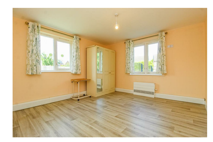
BEDROOM TWO 12'10" x 8'4" (3.92m x 2.56m)

UPVC double glazed windows to the side and rear, central heating radiator and door leading to the wet room.