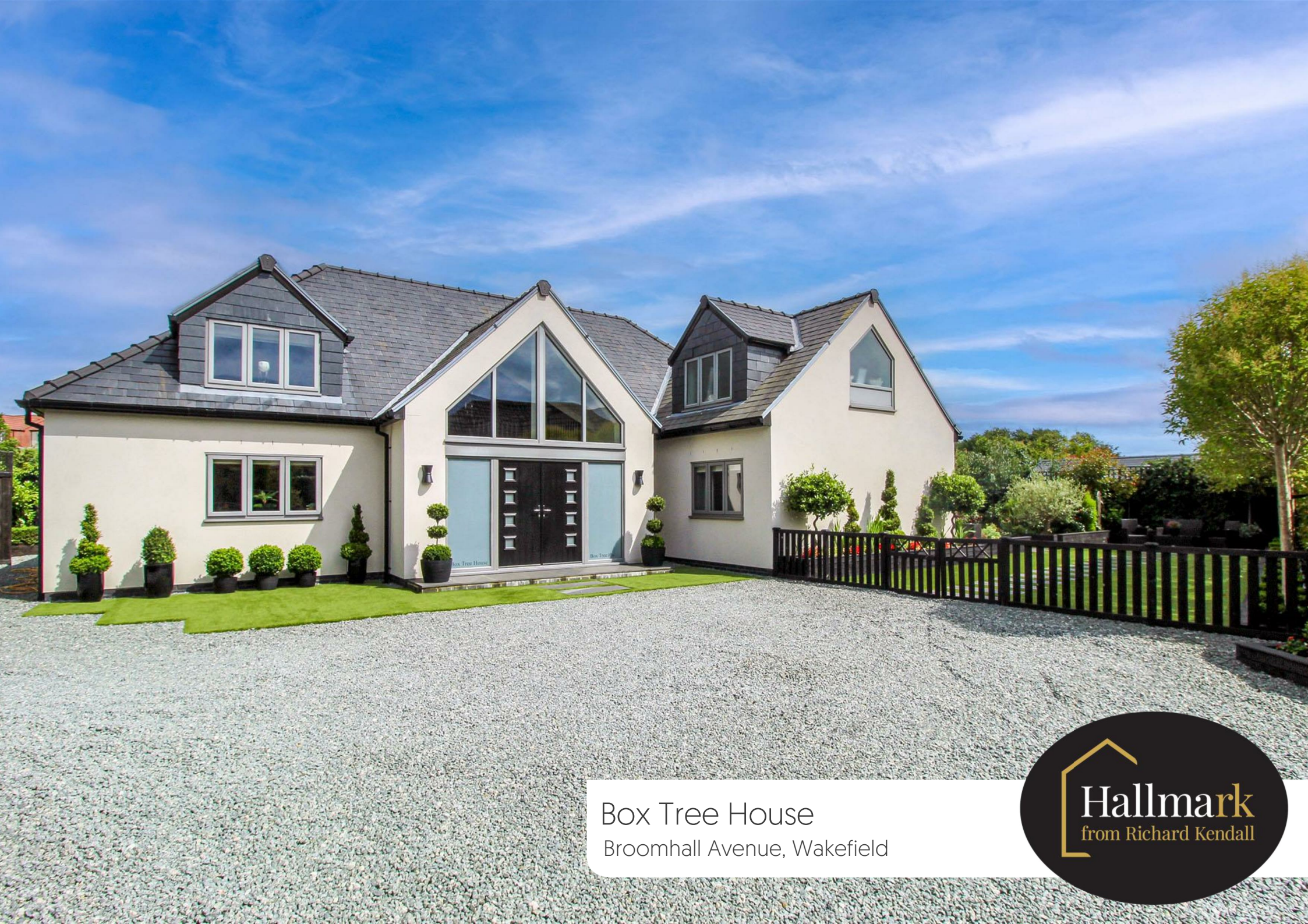
Box Tree House Broomhall Avenue, Wakefield