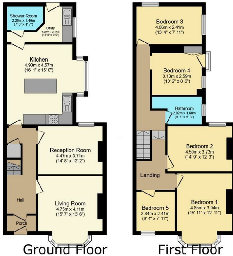
Ground Floor Floor area 63.6 m 2 (684 sq.ft.) First Floor Floor area 62.5 m 2 (672 sq.ft.)