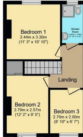
Floor area 37.4 sq.m. (403 sq.ft.) approx

Total floor area 82.0 sq.m. (883 sq.ft.) approx