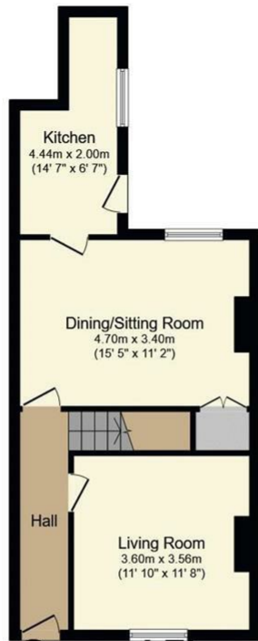
Floor area 44.6 sq.m. (480 sq.ft.) approx