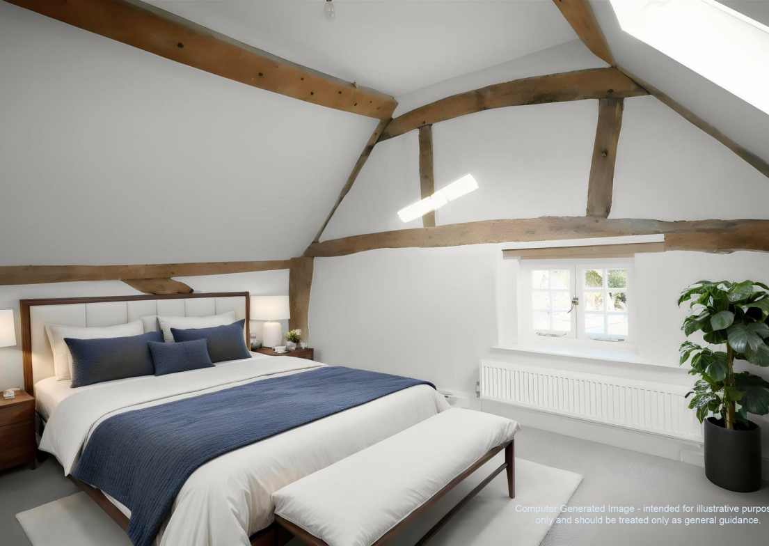
Computer Generated Image - intended for illustrative purposes only and should be treated only as general guidance.