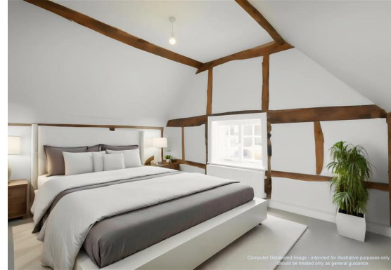
Computer Generated Image - intended for illustrative purposes only and should be treated only as general guidance.