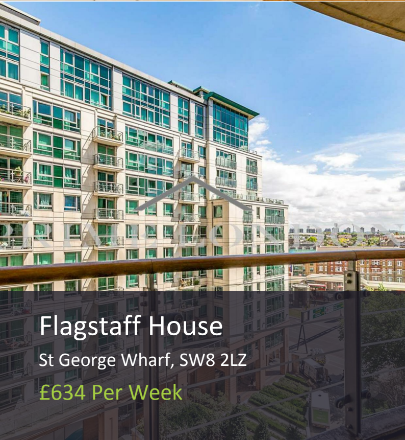
Flagstaff House St George Wharf, SW8 2LZ £634 Per Week