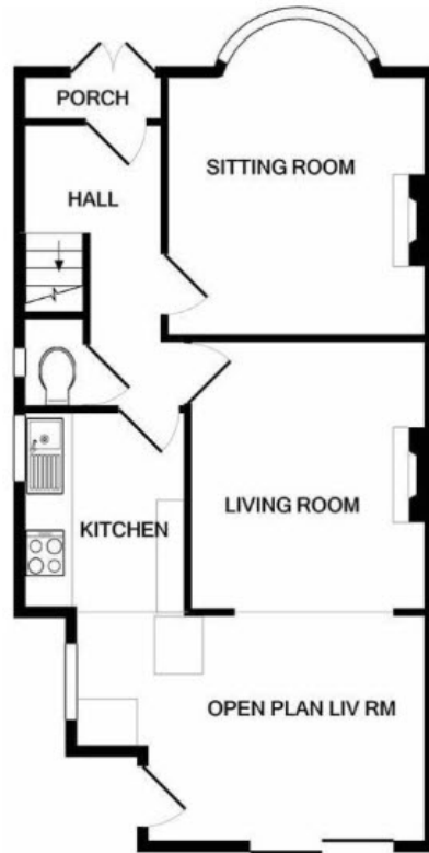
GROUND FLOOR APPROX. FLOOR AREA 542 SQ.FT. (50.3 SQ.M.)