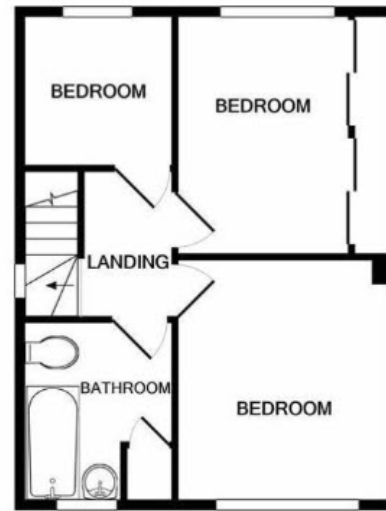
1ST FLOOR APPROX. FLOOR AREA 391 SQ.FT. (36.3 SQ.M.)

TOTAL APPROX. FLOOR AREA 933 SQ.FT. (86.7 SQ.M.)