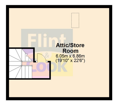
Total area: approx. 178.2 sq. metres (1918.0 sq. feet)

Approx. 41.4 sq. metres (446.2 sq. feet)