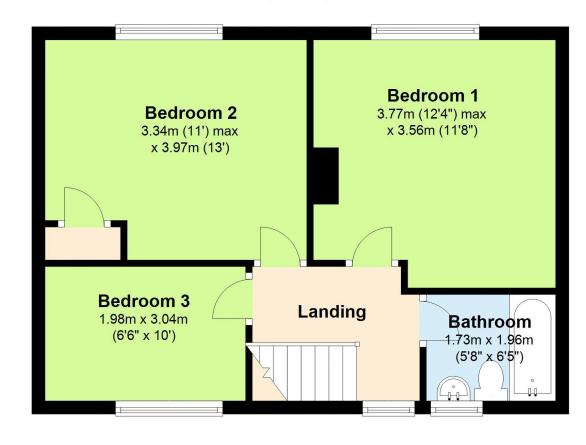
This plan is for illustrative purposes only Plan produced using PlanUp.

Approx. 42.3 sq. metres (454.8 sq. feet)