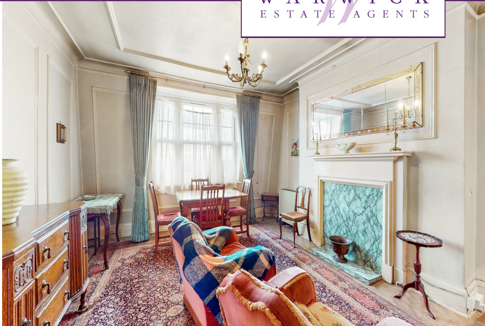
Sidmouth Road, Brondesbury Park, NW2 5HB Asking Price £639,950