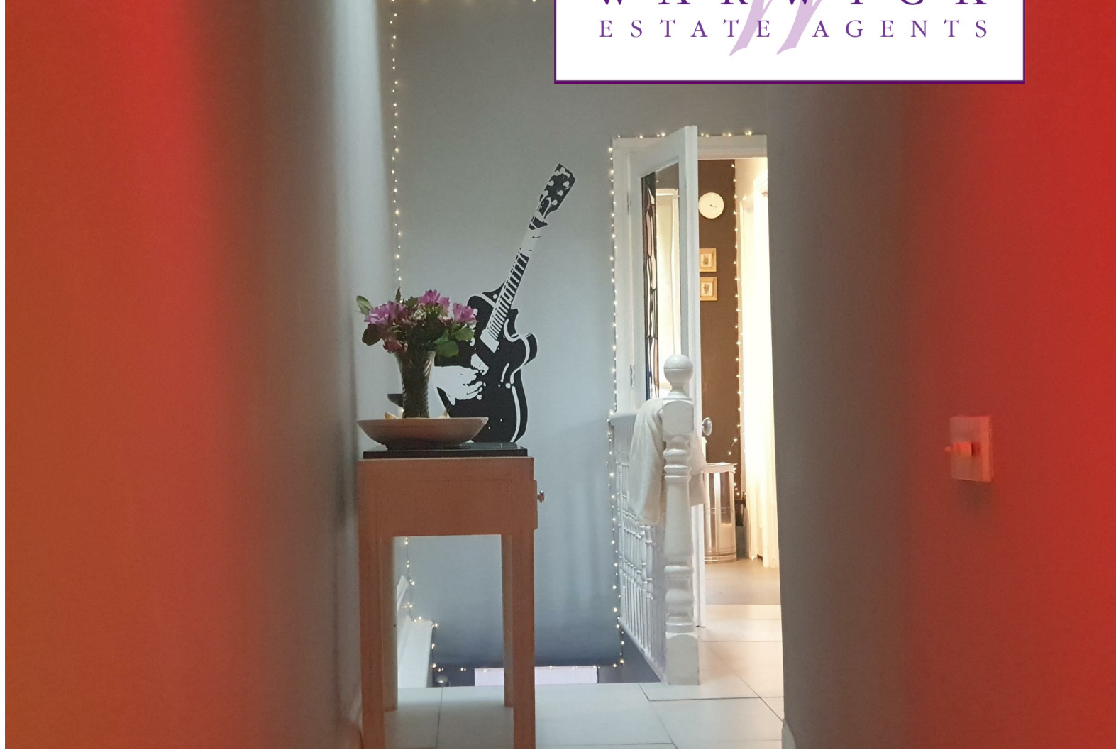
Allington Road, Queens Park, W10 4AY