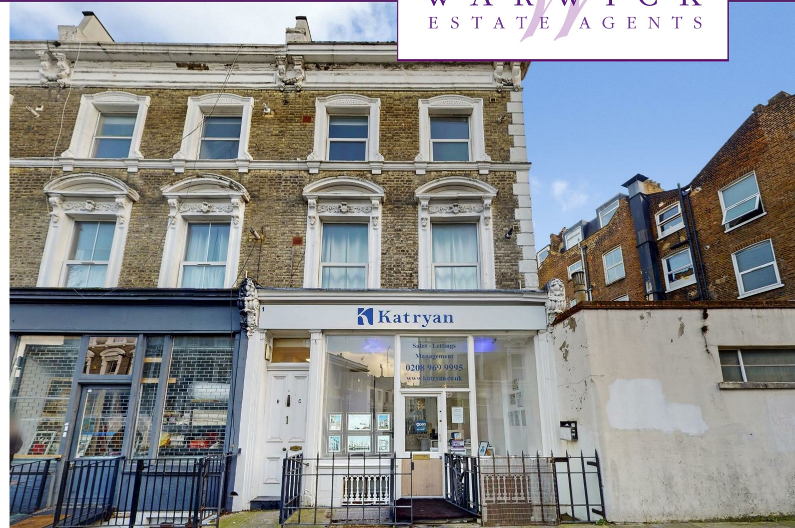
Marylands Road, Maida Vale, W9 2DU