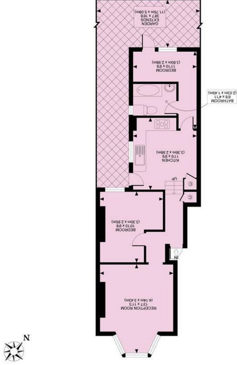
FORTUNGATE ROAD, NW10 TOTAL APPROX FLOOR PLAN AREA 479 SQ.FT. (45 SQ.M.) GROUND FLOOR

All measurements walls, doors, windows, fittings and their appliances, their size and locations are shown conventionally and are approximate only and cannot be regarded as being a representation either by the seller or his agent nor zenluvo www.zenluvo.co.uk