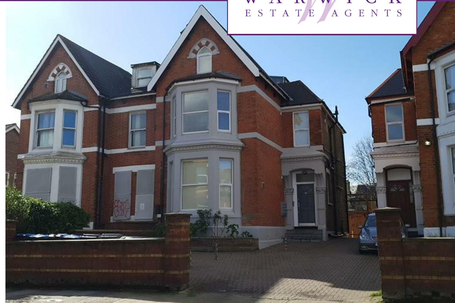
Craven Park, Harlesden, NW10 8SR