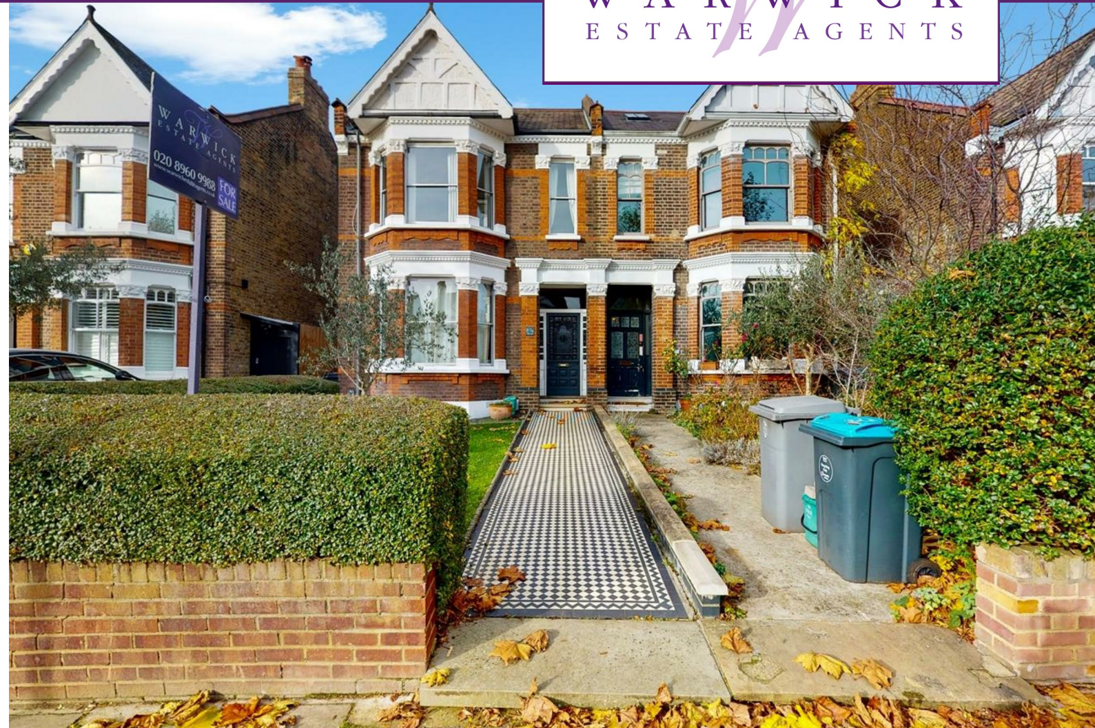
Chevening Road, Queens Park, NW6 6DA