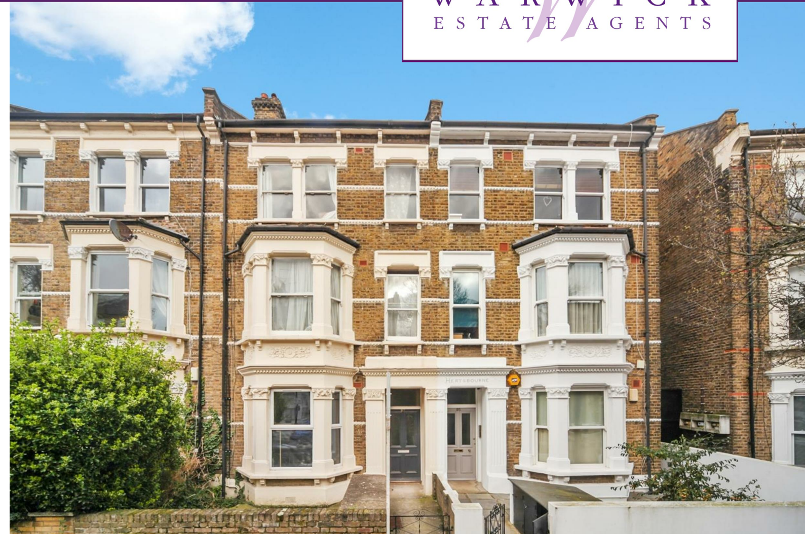
Saltram Crescent, Maida Vale, W9 3JS