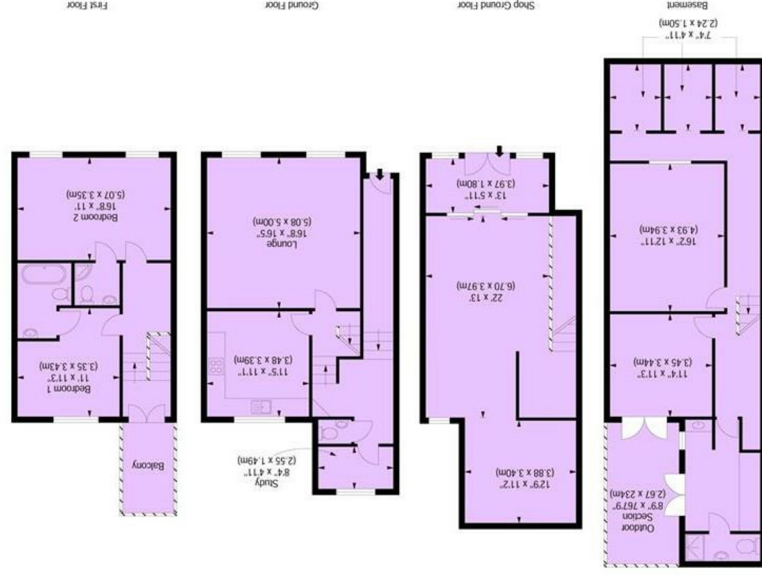
Upper Tachbrook Street, SW1V 1SW Approximate Gross Internal Area 2445 sq ft / 227.14 sq m

Disclaimer : Floor plan measurements are approximate and are for illustrative purposes only. While we do not make the floor plan accurate and complete, you or your advisors should conduct a careful, independent investigation of the property in respect of monetary valuation