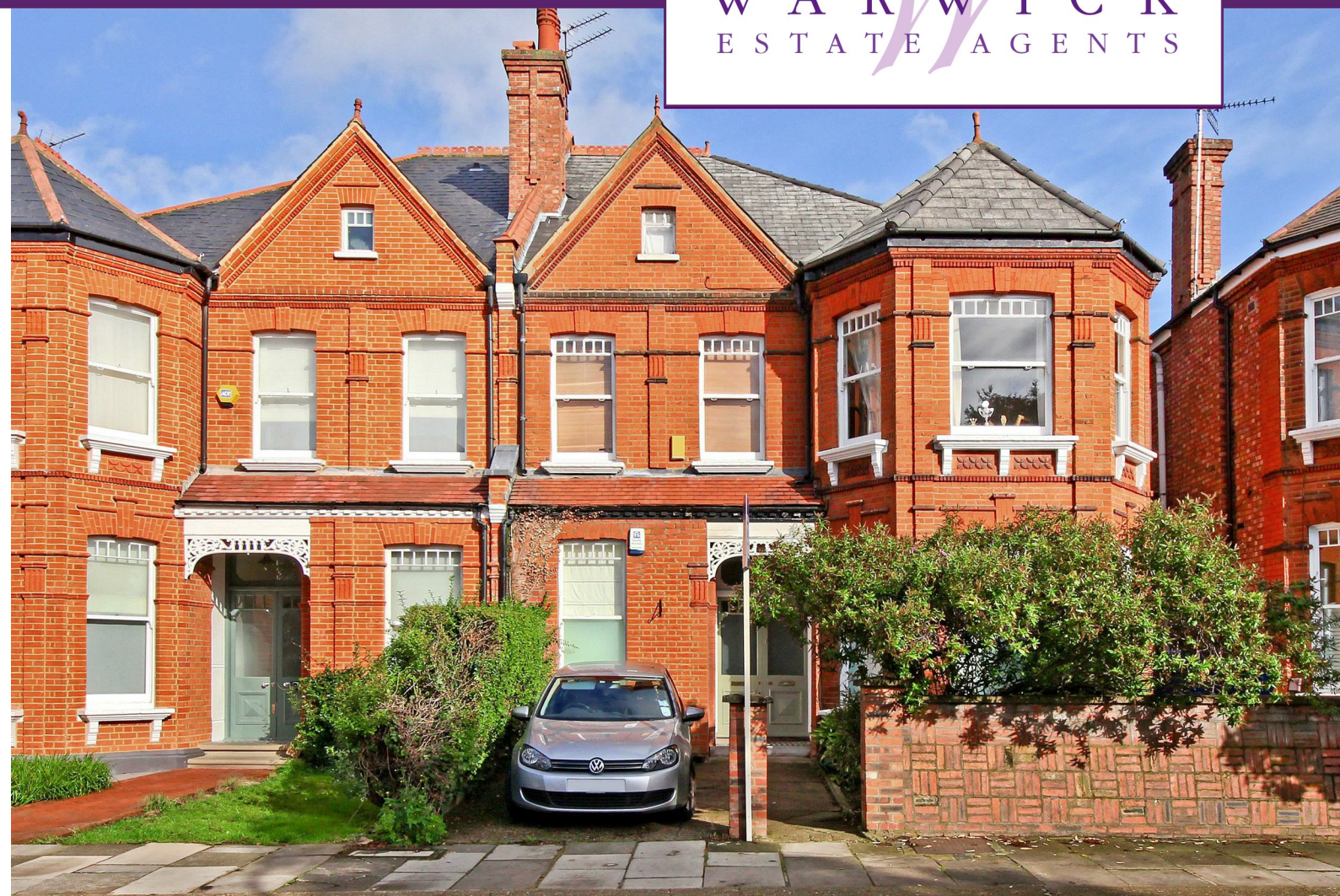
St. Gabriels Road, Mapesbury Estate, NW2 4RY