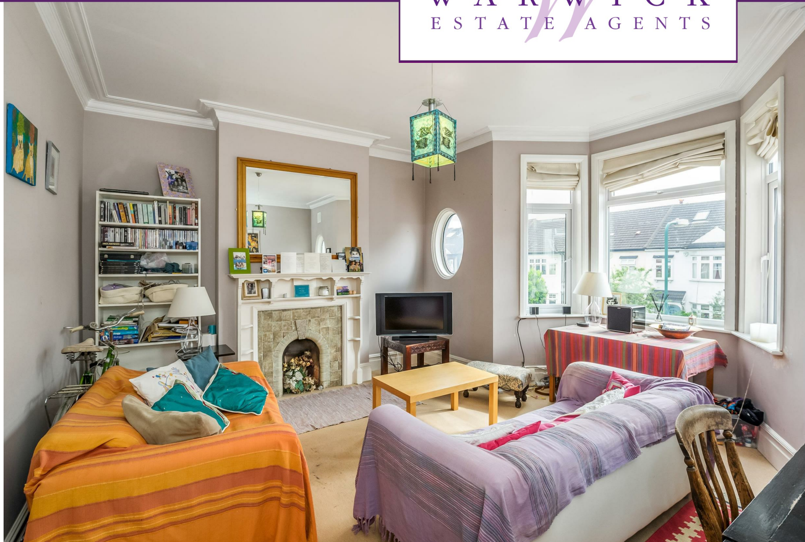
Hanover Road, Brondesbury Park, NW10 3DR