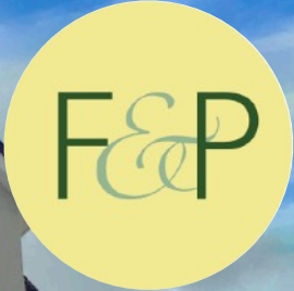
Apt.6, Ocean View West Promenade Rhos on Sea LL28 4FD