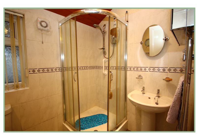
Agent's Notes: The property is leasehold on a 999 lease from 24/6/1914, expires 24/6/2913. Own buildings insurance, £9 per annum ground rent to Mostyn Estates.