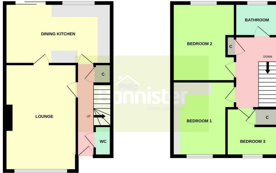
1ST FLOOR 434 sq.ft. (40.4 sq.m.) approx.

TOTAL FLOOR AREA : 893 sq.ft. (82.9 sq.m.) approx.