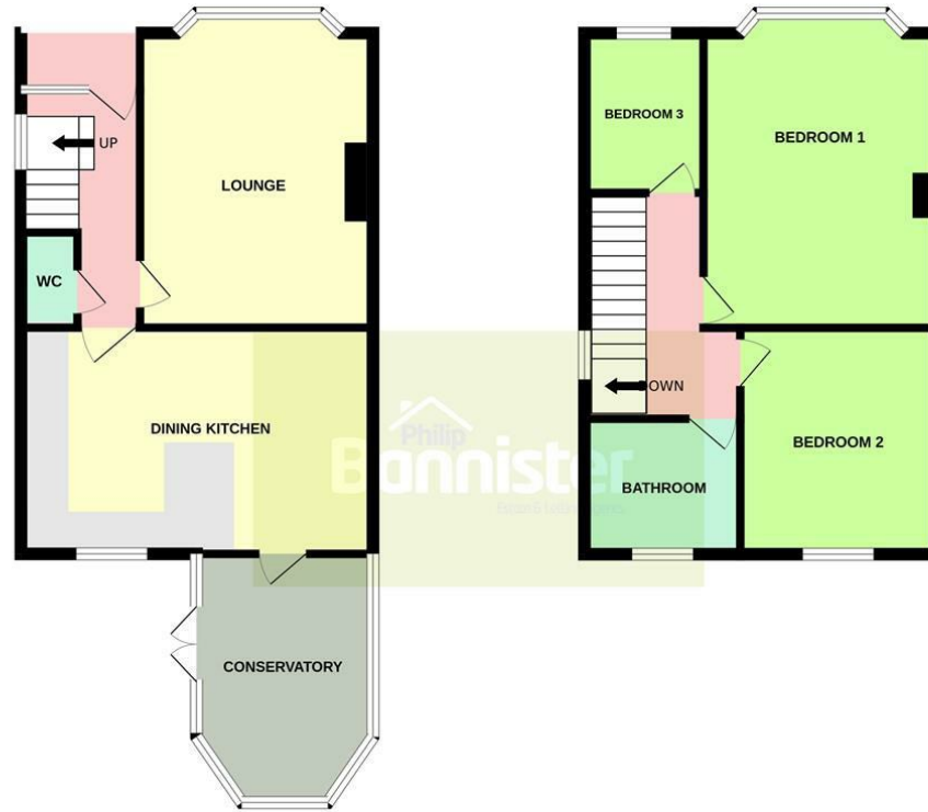
1ST FLOOR 401 sq.ft. (37.3 sq.m.) approx.