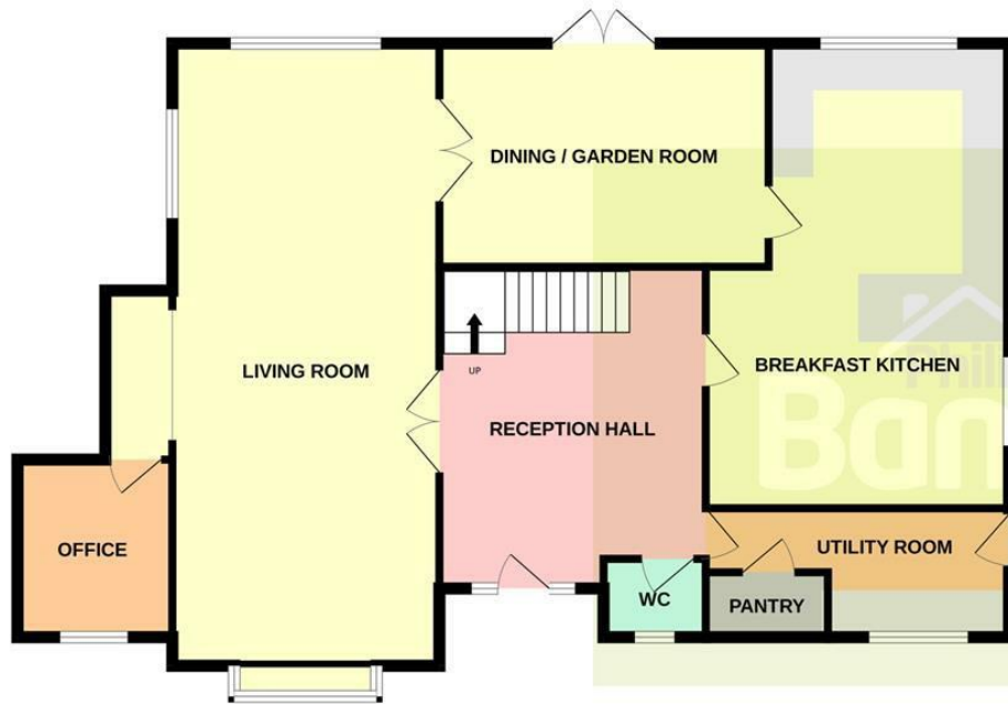
GROUND FLOOR 1258 sq.ft. (116.9 sq.m.) approx.