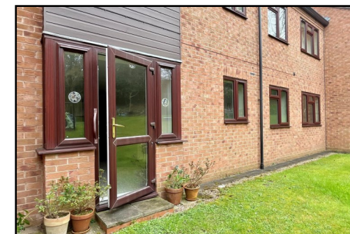
Riland Court, Penns Lane, Sutton Coldfield, B72 1AY

TENURE: We have been informed by the vendors that the property is Leasehold. (Please note that the details of the tenure should be confirmed by any prospective purchaser's solicitor) COUNCIL TAX BAND: A FIXTURES & FITTINGS: As per sales details. VIEWING: Recommended via Acres on 0121 313 2888