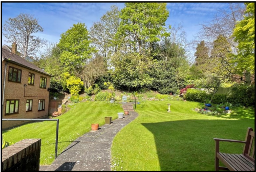
Riland Court, Penns Lane, Sutton Coldfield, B72 1AY

TENURE: We have been informed by the vendors that the property is Leasehold. (Please note that the details of the tenure should be confirmed by any prospective purchaser's solicitor) COUNCIL TAX BAND: A FIXTURES & FITTINGS: As per sales details. VIEWING: Recommended via Acres on 0121 313 2888