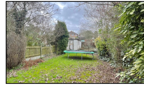
293 EACHELHURST ROAD, WALMLEY, B76 1DS ~ Offers Over £380,000