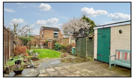
3A, DYCE CLOSE, CASTLE VALE, B35 6JX ~ Offers around £210,000