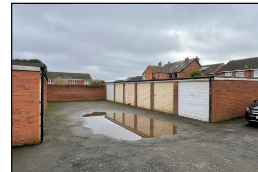
Walmley Ash Road, Sutton Coldfield, B76 1JB

TENURE: We have been informed by the vendors that the property is Freehold. (Please note that the details of the tenure should be confirmed by any prospective purchaser's solicitor) COUNCIL TAX BAND: C FIXTURES & FITTINGS: As per sales details. VIEWING: Recommended via Acres on 0121 313 2888