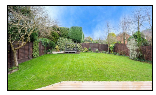
24 GLENFIELD CLOSE, WALMLEY, B76 1LD ~ Offers Over £560,000