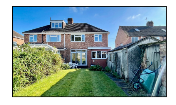
73 SPRINGFIELD CRESCENT, WALMLEY, B76 2ST ~ Offers Over £300,000