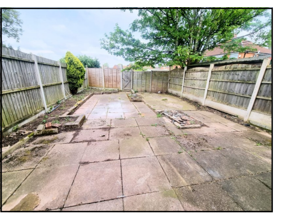
16 Lilac Avenue, Great Barr, B44 8LX - Offers in the region of £210,000