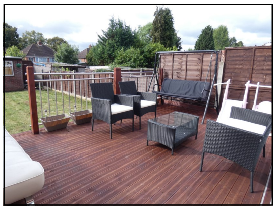
Sandringham Road, Great Barr, B42 1PU - Offers in excess of £257,000