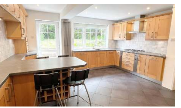
1 REDWOOD CLOSE, STREETLY, B74 3JQ - OFFERS AROUND - £580,000