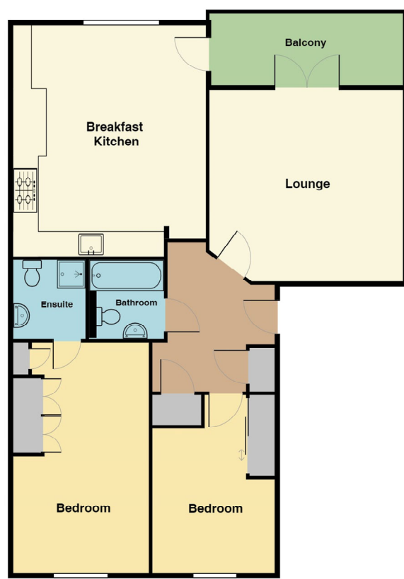
THIS PLAN IS NOT TO SCALE AND IS GIVEN TO PROVIDE A GENERAL GUIDE. IT MERELY INDICATES APPROXIMATE RELATIONSHIP OF ONE ROOM TO ANOTHER.