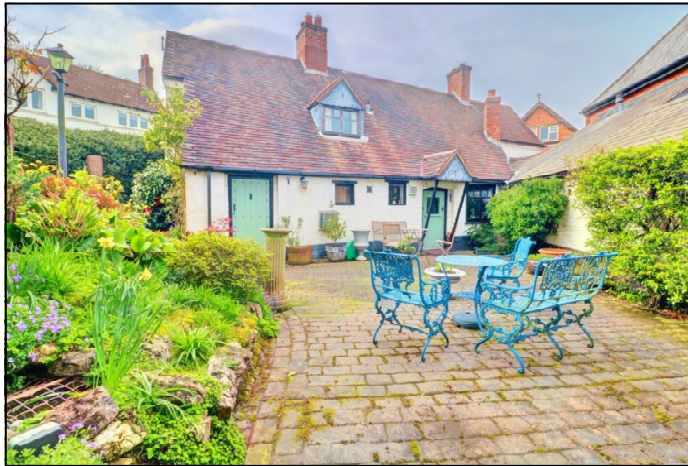
Park Drive, Four Oaks