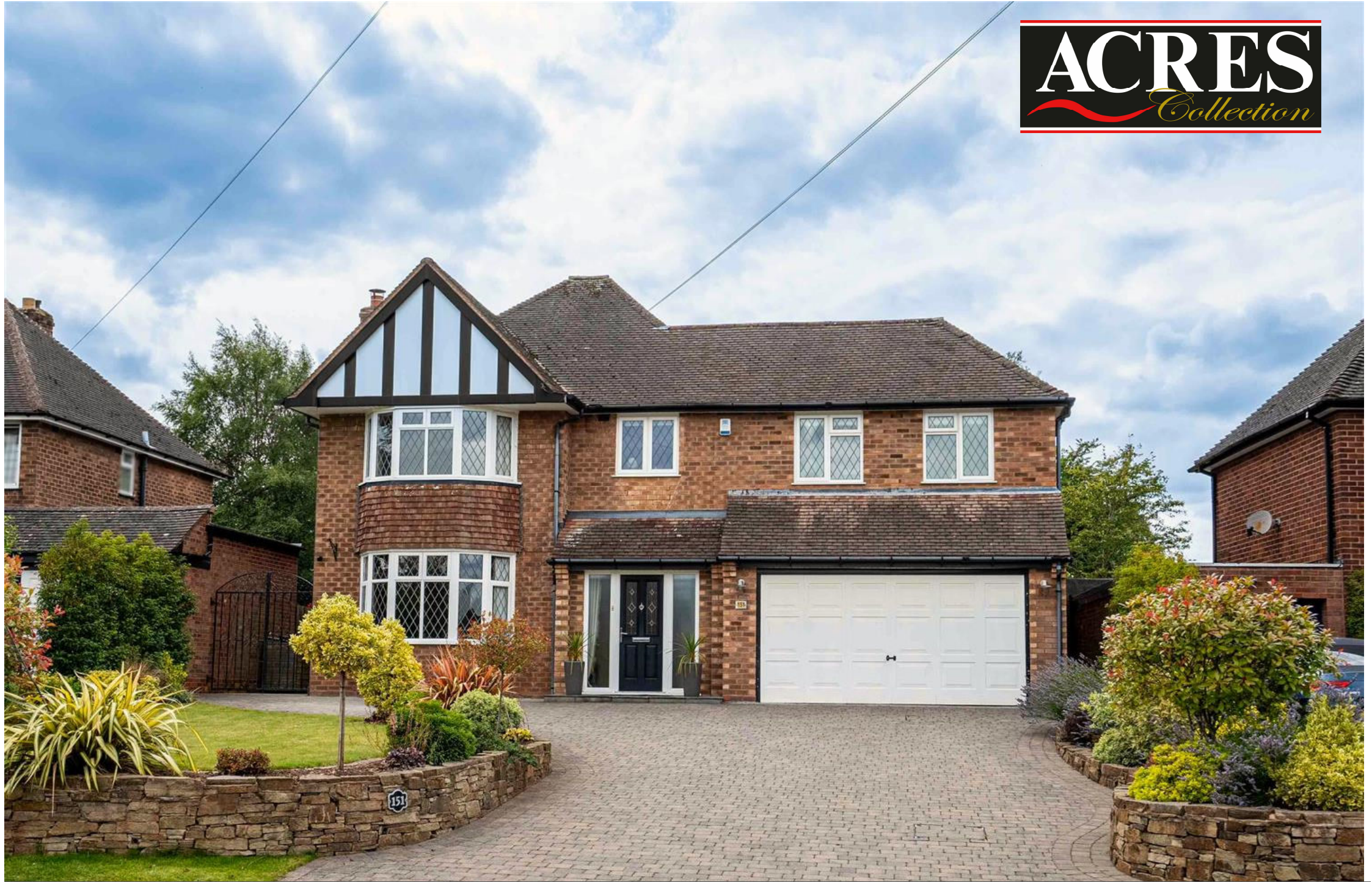
151 LITTLE SUTTON LANE, FOUR OAKS B75 6SW