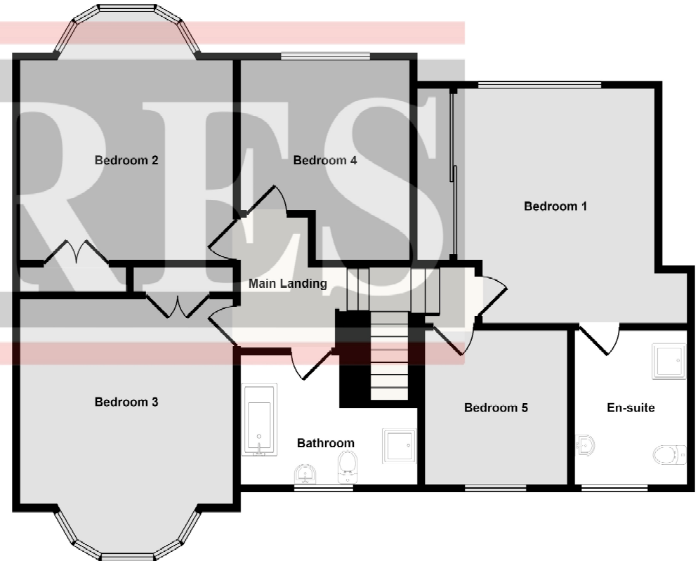
First Floor Approx 100 sq m / 1079 sq ft

This floorplan is only for illustrative purposes and is not to scale. Measurements of rooms, doors, windows, and any items are approximate and no responsibility is taken for any error, omission or mis-statement. Icons of items such as bathroom suites are representative only and may not look like the real items. Made with Made Possible.