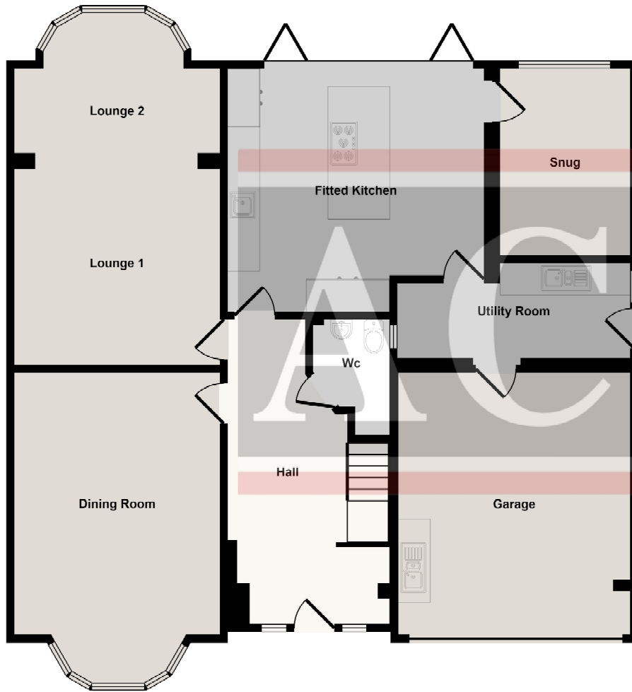
Ground Floor Approx 126 sq m / 1360 sq ft